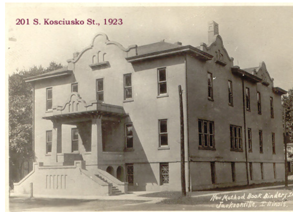
New Method Book Bindery, 1923